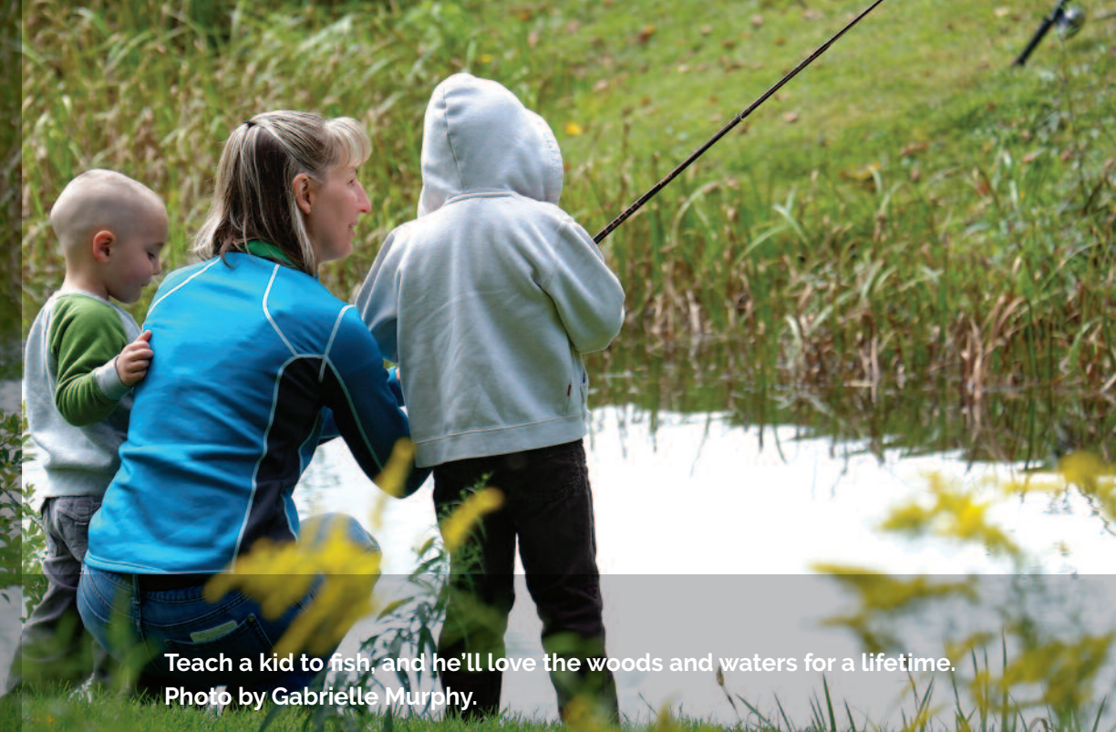
Teach a kid to fish, and he'll love the woods and waters for a lifetime.

Onyx Specialty Papers Holiday Brook Farm Berkshire Property Agents MassWildlife Blue Q Cain Hibbard & Myers Greylock Federal Credit Union Canyon Ranch Berkshire Bank Foundation Berkshire Environmental Consultants Berkshire Outfitters Berkshire Veneer Company Classical Tents Main Street Hospitality Bola Granola Dave's Sporting Goods